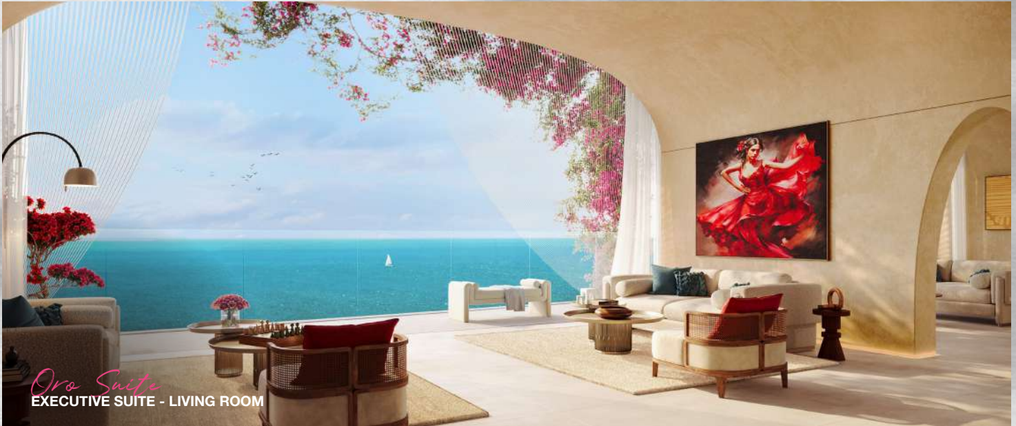
Oro Suite EXECUTIVE SUITE - LIVING ROOM