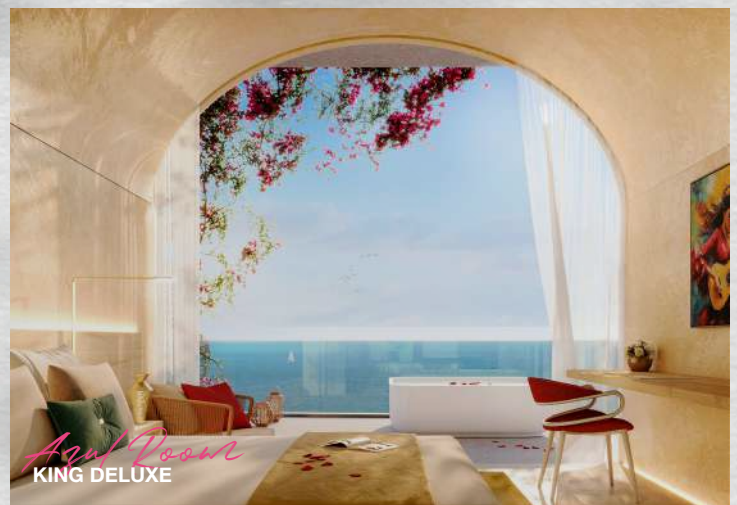
Aqua Room KING DELUXE