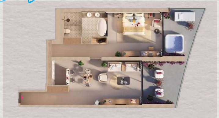
KING SUITE TYPE A1