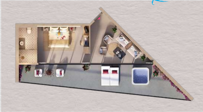
KING SUITE TYPE A