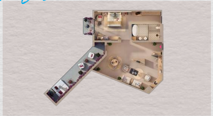
EXECUTIVE SUITE TYPE A1