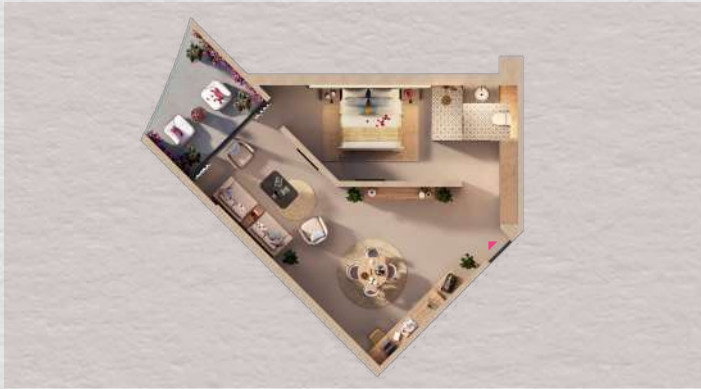
KING SUITE TYPE A2