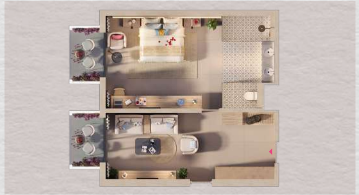
KING SUITE TYPE A3