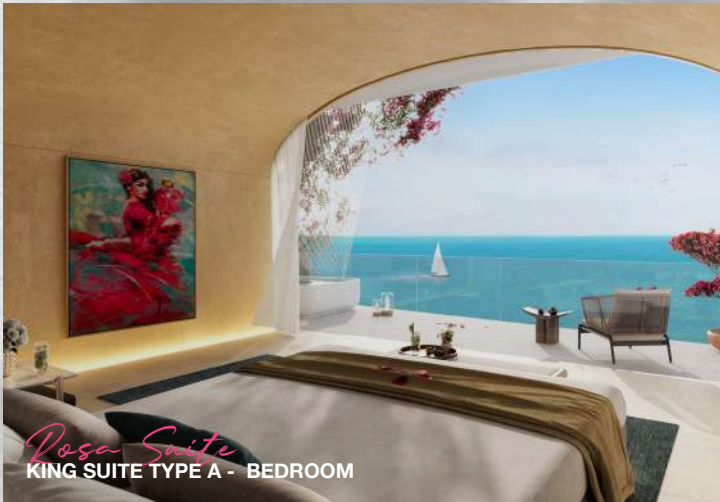
Rosa Suite KING SUITE TYPE A - BEDROOM