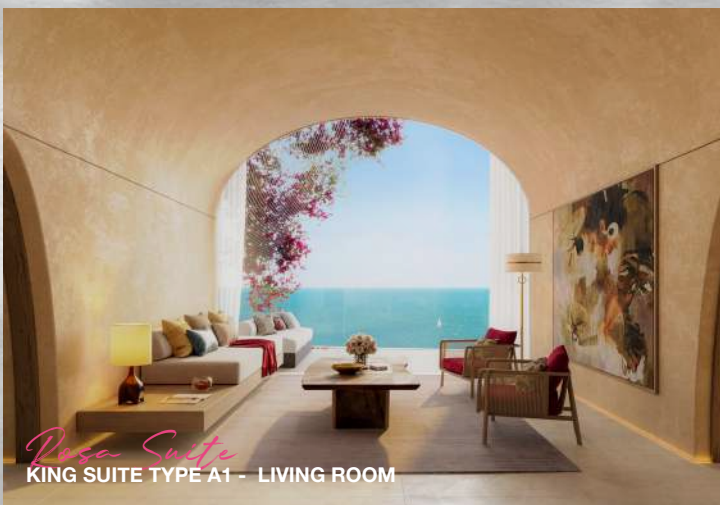
Rosa Suite KING SUITE TYPE A1 - LIVING ROOM