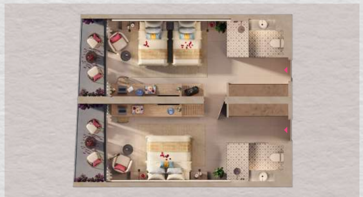
KING / TWIN DELUXE (CONNECTED)