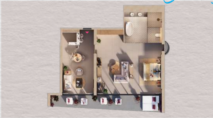
EXECUTIVE SUITE TYPE A